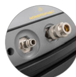
COMBI Kit (optional)