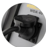
Power tool connection