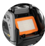
PTFE flat filter