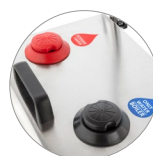
Water and cleaning solution tanks