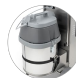
Powerful suction motor (V)