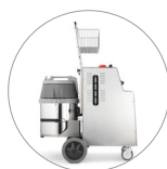
Sturdy stainless steel frame