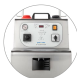
Control panel with display and pressure gauge