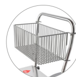
Trolley with basket holder for accessories