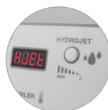
Hydrojet Function (H)