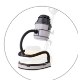
Suction kit (optional)