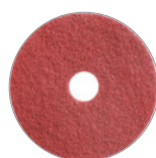
Extensive range of pads and brushes