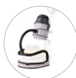
Suction kit (optional)