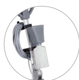
Spray electric system