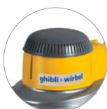
New plastic cover (M22)