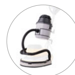
Suction kit (optional)