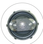
Planetary gear (M22)