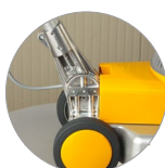
Articulation of the handle