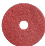
Extensive range of pads and brushes