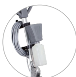
Spray electric system