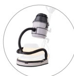
Suction kit (optional)