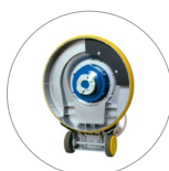
Mount for drive board and brushes