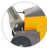
Articulation of the handle