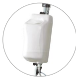
Tank 9 l (optional)