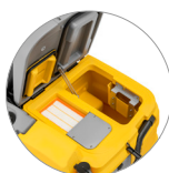
Debris tray + vacuum filter