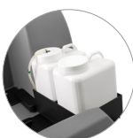
Chemical mixing system