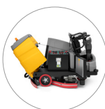
Immediate opening/ access to all the main components