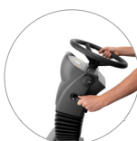
Adjustable steering wheel