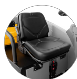
Adjustable and ergonomic seat