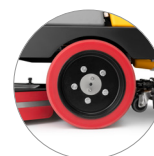
Traction on rear wheels (RD versions)