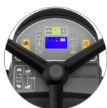
Control panel with display