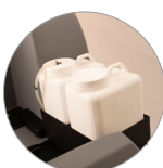
Chemical mixing system