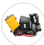
Immediate opening/access to all the main components