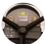
Control panel with display