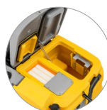
Debris tray + vacuum filter