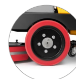
Traction on rear wheels (R R 300 RD 130 CHEM versions)