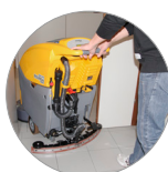
Adjustable and compact squeegee