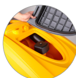
Debris tray + vacuum filter