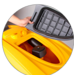
Debris tray + vacuum filter