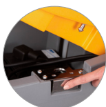
Tiltable recovery tank