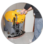
Adjustable and compact squeegee