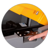
Tiltable recovery tank