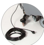
25 m cable as standard