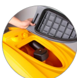
Debris tray + vacuum filter