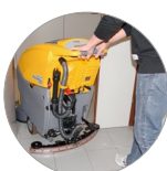
Adjustable and compact squeegee