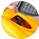
Debris tray + vacuum filter