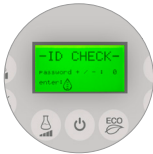
Password for reliability and ease of use