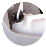
Chemical mixing system