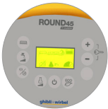
Control panel with display