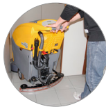
Adjustable and compact squeegee