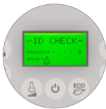
Password for reliability and ease of use