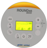
Control panel with display