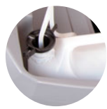
Chemical mixing system