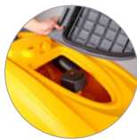
Debris tray + vacuum filter