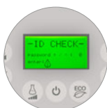
Password for reliability and ease of use