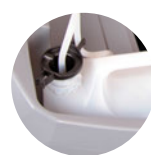
Chemical mixing system