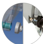
“Built in” solution tank filter