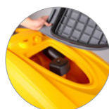
Debris tray + vacuum filter