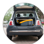
Easy to transport, park, store