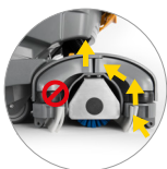
Alternate twin squeegee system (patented)