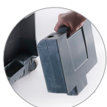
Two types of lithium batteries available (10 Ah and 20 Ah)