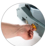
Adjustable down pressure by knob (3 steps)