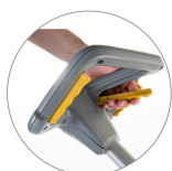
Ergonomic handle with unlocking system