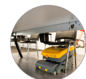
Compact dimensions to go and work where no one arrives