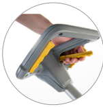
Ergonomic handle with unlocking system