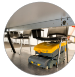
Compact dimensions to go and work where no one arrives