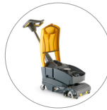
Fast and easy maintenance