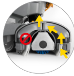
Alternate twin squeegee system (patented)