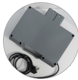
Power supply kit case