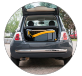
Easy to transport, park, store