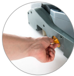
Adjustable down pressure by knob (3 steps)