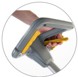
Ergonomic handle with unlocking system