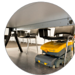
Compact dimensions to go and work where no one arrives