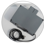
Power supply kit case