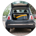
Easy to transport, park, store