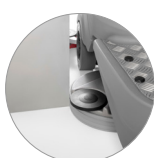
Retractable brush deck, maximum safety and practicality