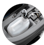
Chemical mixing system