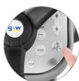
"Ready to go" function