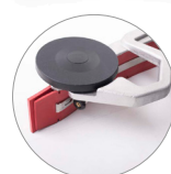
Aluminium squeegee group