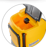
Wide recovery tank opening: easy to clean