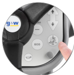
"Ready to go" function