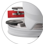
Aluminium brush head and squeegee group