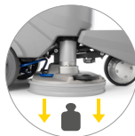
Extra down pressure