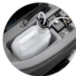
Chemical mixing system