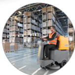
Ergonomics and comfort