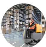
Ergonomics and comfort