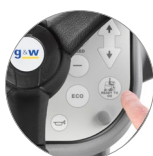
"Ready to go" function