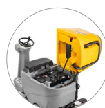
Immediate opening/ access to all the main components