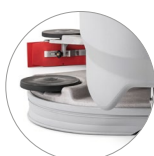
Aluminium brush head and squeegee group