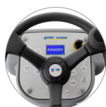
Control panel with display