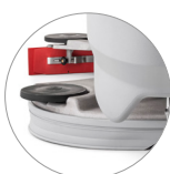
Aluminium brush head and squeegee group