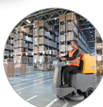
Ergonomics and comfort