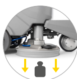
Extra down pressure