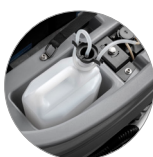
Chemical mixing system