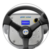
Control panel with display