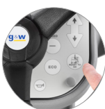
"Ready to go" function