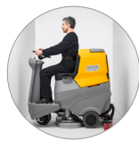
Compact dimensions, comfort in narrow spaces