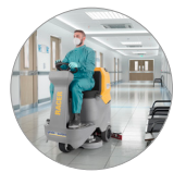
Silent mode function