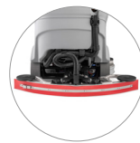
Compact squeegee with natural rubber blades