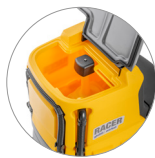
Wide recovery tank opening: easy to clean