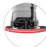
Compact squeegee with natural rubber blades