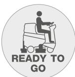
"Ready to go" function