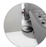
Retractable aluminium brush deck