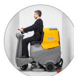
Compact dimensions, comfort in narrow spaces