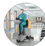
Silent mode function