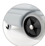
Front swivel castor wheels and rear large diameter wheels