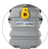
Shockproof container in plastic material