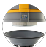
PTFE cartridge filter (M filtration class)