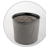
TNT filter (optional)