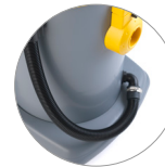
Drain hose to empty the container from liquids (PD)