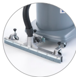
Gangway tool (optional)