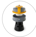
Ultra FilteRing System