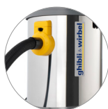
Stainless steel container sturdy and durable