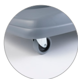
Front swivel castor wheels