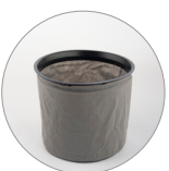
TNT filter (optional)