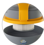
PTFE cartridge filter (M filtration class)