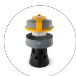
Ultra FilteRing System