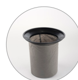
TNT filter (optional)