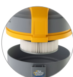
PTFE cartridge filter (M filtration class)