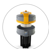
Ultra FilteRing System