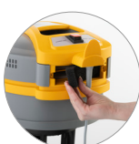
Exhaust air filter