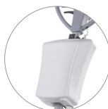
Tank 12 l (optional)