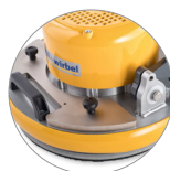
Extra weights (6,5 and 13 Kg - optional)