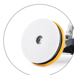
Various types of pads