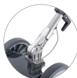
Articulation of the handle