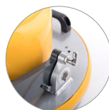
Brush head locking system