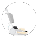
Spray system (optional)