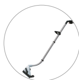
Floor spray-ex alu tool (optional)