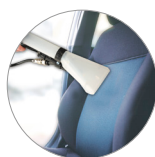
Ideal for every type of textile surface