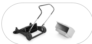
Large dirt container