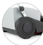
Large rear wheels