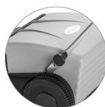
Quick stop mechanism of the handlebar