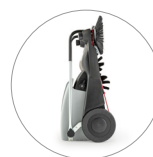
Compact dimensions: easy to store