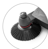
Adjustable side brushes