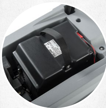
HYBRID KIT (2 HOURS RUNNING TIME AND 1 HOUR CHARGING TIME)