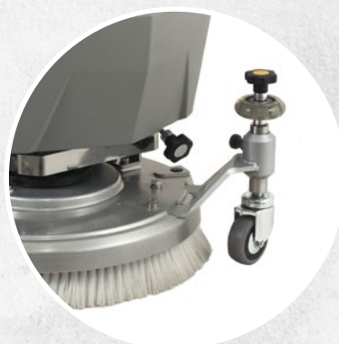
PERFECT ADJUSTMENT OF THE HEAD