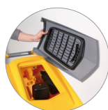
Debris tray + recovery tank filter