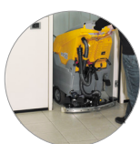
Adjustable and compact squeegee