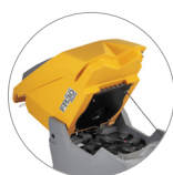
Tiltable recovery tank