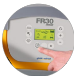
"Silent mode" function