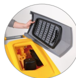
Debris tray + recovery tank filter