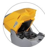
Tiltable recovery tank