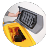
Debris tray + recovery tank filter