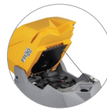
Tiltable recovery tank