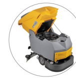
Tiltable recovery tank