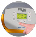
"Silent mode" function