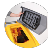
Debris tray + recovery tank filter