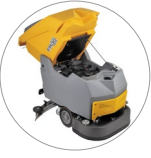
Tiltable recovery tank