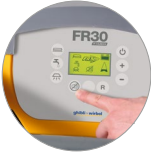
"Silent mode" function