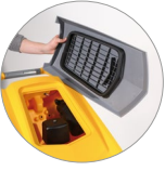
Debris tray + recovery tank filter