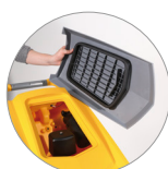
Debris tray + recovery tank filter