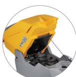
Tiltable recovery tank