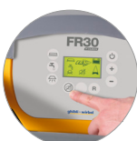
"Silent mode" function