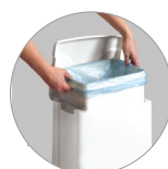
Plastic bags for the bin