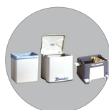
Easy access to the components