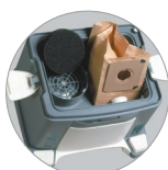
Paper filter bag