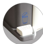
Foot leverage system to open the cover