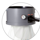
Manual filter shaker (optional)