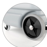
Front swivel castor wheels and rear large diameter wheels