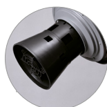
Cage bag support with floater