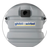
Shockproof container in plastic material