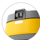
Three motors switchable