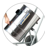
Tilting system CBM