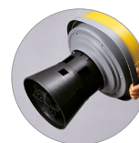
Cage bag support with floater