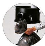
Spacer for plastic bag (optional)