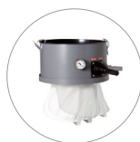
Manual filter shaker (optional)