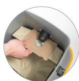
Ecological paper filter bag