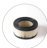
Cartridge filter (FC version)