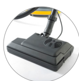
Electric power brush (optional)