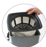
Polyester filter (FT version)