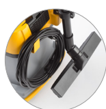
New holding system for accessories and cable