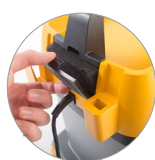
Exhaust air filter