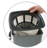
Polyester filter (FT version)