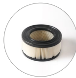
Cartridge filter (FC version)