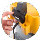
Exhaust air filter