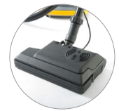
Electric power brush (optional)