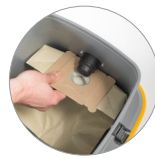
Ecological paper filter bag