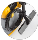
New holding system for accessories and cable