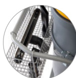
Practical basket holder for accessories