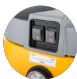
Vacuum cleaner with 3 motors