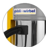
Intake Ø 50 (AS 40 KS M/H)