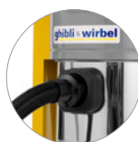
Intake Ø 90 (AS 40 KS)