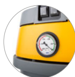
Clogged filter pressure gauge