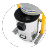
Detachable stainless steel container