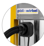
Intake Ø 90 (AS 40 KS)