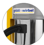
Intake Ø 50 (AS 40 KS M/H)