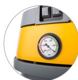
Clogged filter pressure gauge