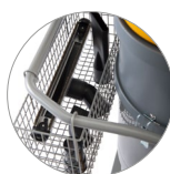
Practical basket holder for accessories