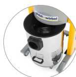
Detachable stainless steel container