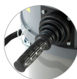
Manual filter shaking system