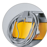
Hook for power supply cable