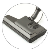
Electric power brush (optional)