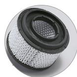
HEPA Cartridge filter (optional)